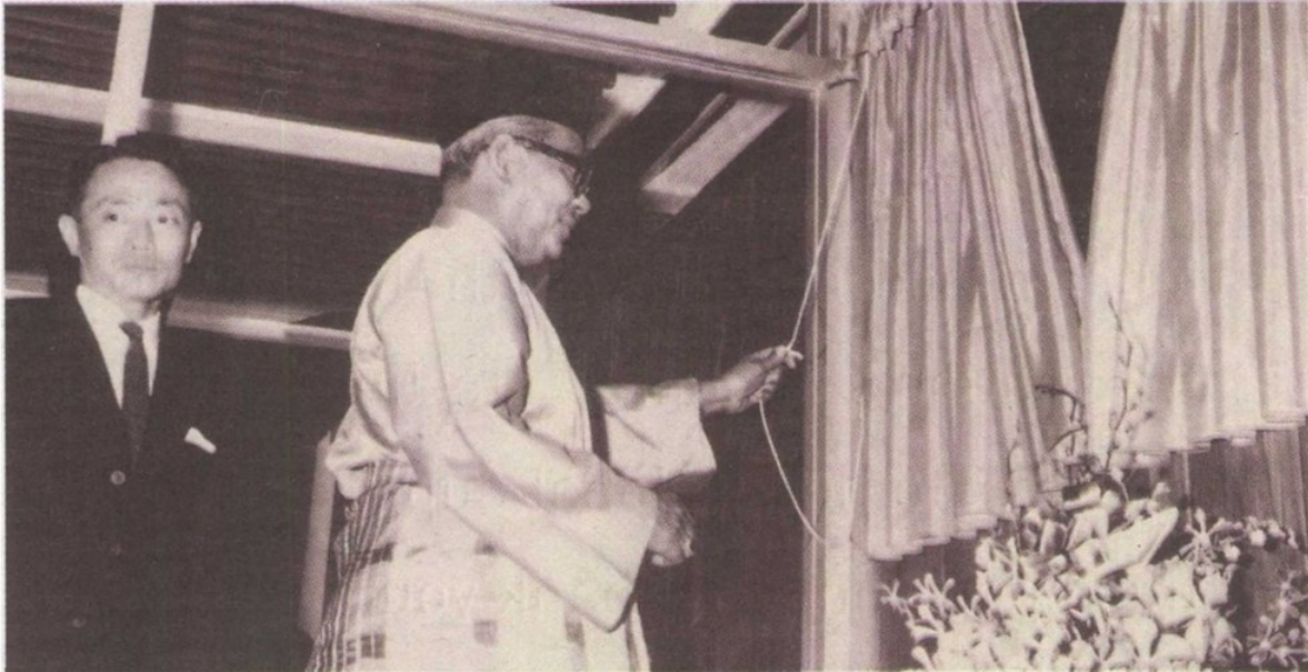
Malaysia's first Prime Minister Tunku Abdul Rahman officiating at the launch of MSM's first sugar refinery in Prai, Penang, accompanied by MSM founder Robert Kuok, the first milestone in MSM's 50-year journey.

Provided for client's internal research purposes only. May not be further copied, distributed, sold or published in any form without the prior consent of the copyright owner.