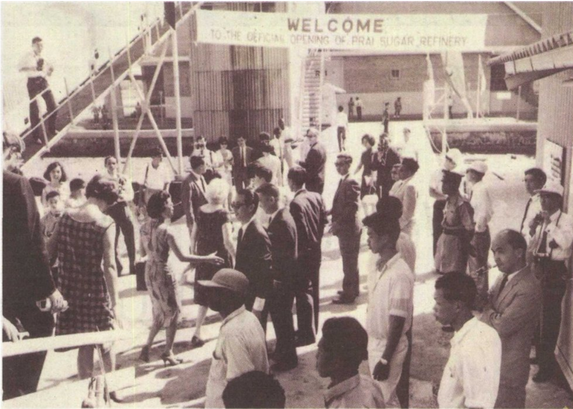
In 1964, the opening of the Prai sugar refinery was greeted with much fanfare.