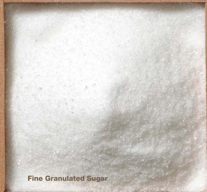
Fine Granulated Sugar

MSM is determined to become a global top 10 player in the sugar industry by 2020.