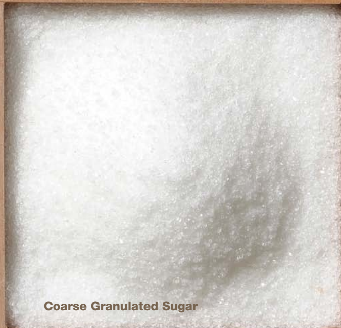
Coarse Granulated Sugar