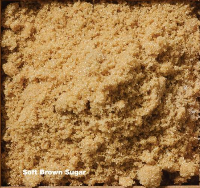
Soft Brown Sugar