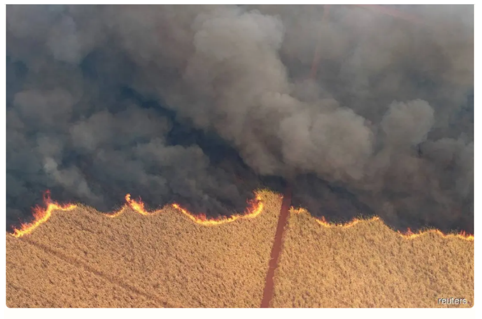
A drone view shows a fire in a sugar cane plantation near Dumon city, Brazil, August 24, 2024

KUALA LUMPUR (Sept 4): Sugar producer MSM Malaysia Holdings Bhd (KL:MSM said it was not impacted by the recent crop fire in key producer Brazil, as it hedged all its raw sugar requirements under the wholesale segment in 2024.