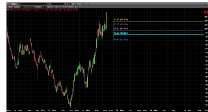
Figure 2 As per our technical analysis, we are reaching the top and can expect a breakout as market has broken 21.22 cents/lb high. A retracement is highly likely to happen. Elliot Wave chart showing the market is about to reach the top and next move is downward.

London white sugar Oct 16 contract expired this week with 2,765 lots or 138,250 MT for delivery with one house taking and two trade houses delivering. On the container whites there were a total of 210 lots or 10,500 MT delivery with two trade houses delivering and three receiving.